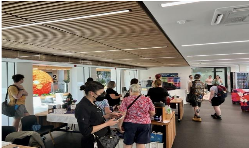
November highlighted 3D Printing and mindful knitting